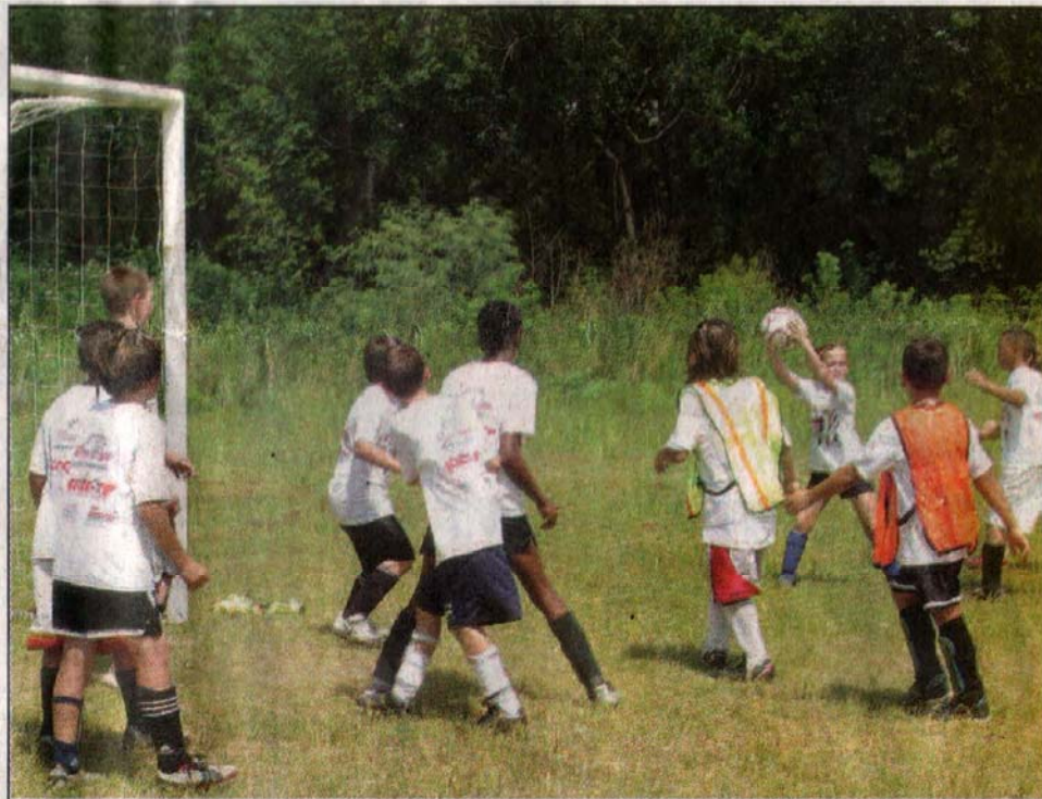
GOAL! Pushing one through the nets is a reason to celebrate.